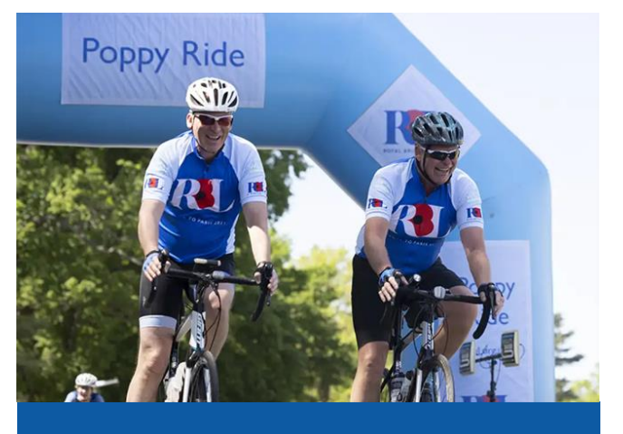
Fundraising opportunities for 2025

Have you made any New Year's resolutions to be more active or give yourself a new challenge? If so, one of RBL's fundraising events could be just what you're looking for.