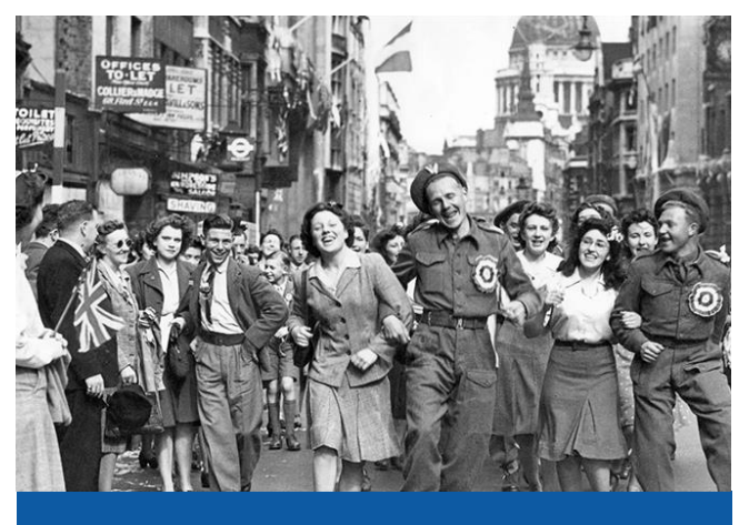
Commemorating VE and VJ Day

This year marks 80 years since Victory in Europe (8th May 1945) and Victory over Japan (15th August 1945). Veterans will be at the heart of national and local events, honouring their service and sacrifice for the freedoms we enjoy today. If you are a veteran of the Second World War or have a connection – across the UK, Commonwealth and Allied nations – we'd love to know your story and involve you in commemorative events.