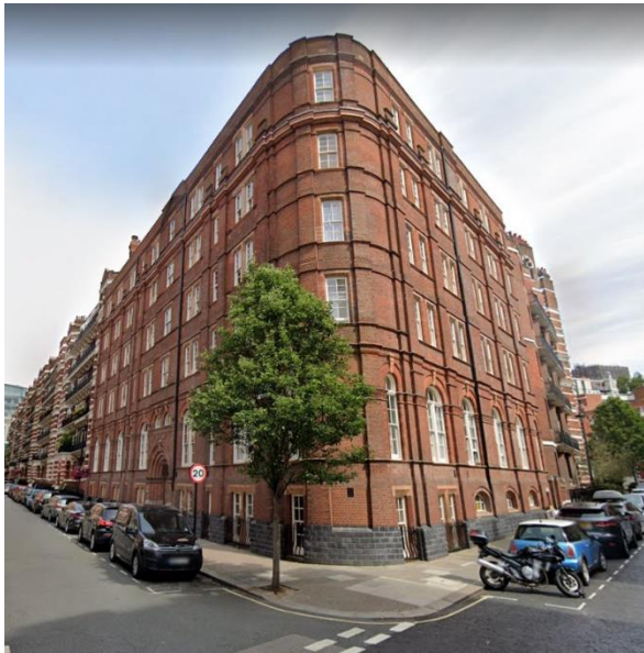
Ambrosden Section House