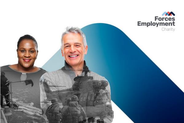
New Year, New Career?

Finding a job can be a daunting prospect but our partners at The Forces Employment Charity provide all ex-Forces personnel with free, life-long support to help find the career that works best for you. They will also support you with career progression, so if your current job is not the best fit, they can help you find your next role with an employer who understands the true value of ex-military recruitment. Find out more.