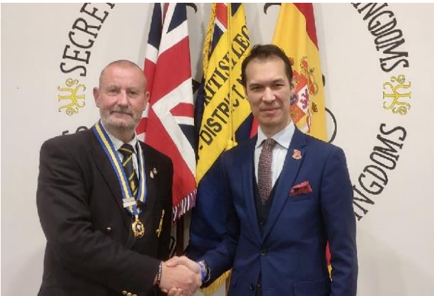
New branch in Madrid