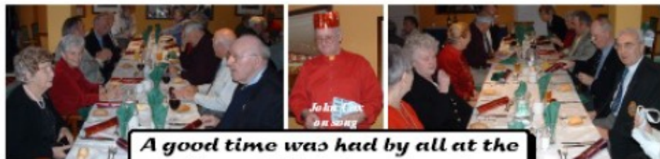
A good time was had by all at the Branch Christmas Lunch

Walking along Nelson Street the other day, I passed an elderly lady leaving her neighbour's house. "I'll pop in again later", she said, "or I'll text you." Not only had the lady mastered the mobile phone, but the art of sending text messages, too. Not so long ago I expect she would have banged on the wall!