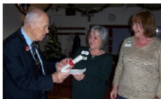
Scroll to Home Start