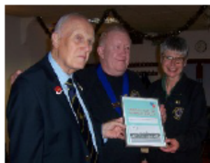
Certificate to Lions Club