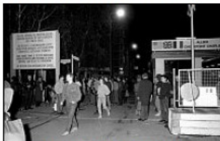
The night the border was opened at Checkpoint Charlie on 9th November 1989

Looking across to the East there were 2 Russian soldiers in uniform with rifles etc. They just stood there and observed us. They were about 20 feet from where we were. No communication was made by either side. I took a few photos of them. Then all of a sudden we heard some