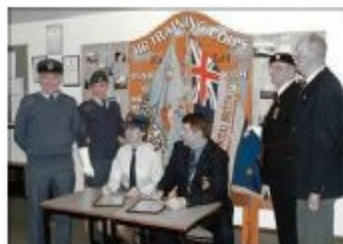
ATC affiliation February 2004