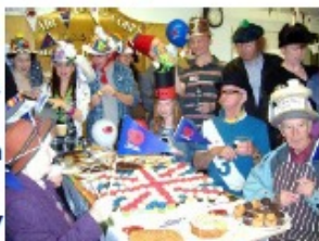
ATC Mad Hatters tea party for RBL Branch 90 th Anniversary