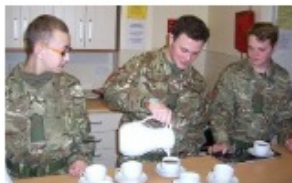
Army Cadets helping at Coffee Morning