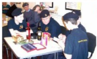
Sea Cadets help at Coffee Mornings, too