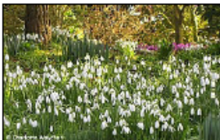
February - Snowdrop time