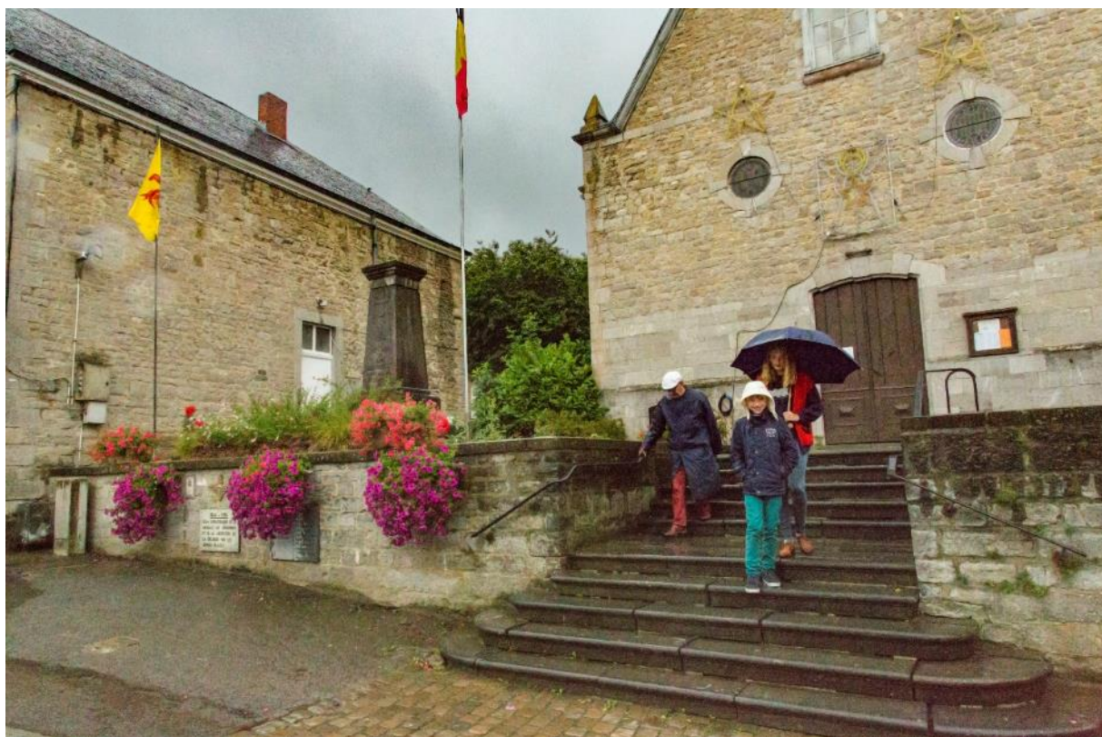
Church of Bure

From the church in Bure we drove up to a chapel, Chapelle Notre-Dame de Haut", on the hill between Bure and Wavreille where, as per Geoff's recollection, fierce fighting had been going on