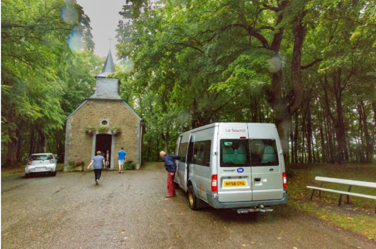
Chapel, Chapelle Notre-Dame de Haut”, on the hill between Bure and Wavreille where fierce fighting took place and where reinforcement troops had been parachuted in

and also reinforcements had been parachuted in. Probably of the 13 th (Lancashire) Battalion, “The Parachute regiment” for which another memorial in front of the church of Bure reads: “ ‘WIN OR DIE’ – 13 th (LANCASHIRE) – BATTALION – THE PARACHUTE – REGIMENT – 61 officers and men of this battalion gave their lives during the battle for the village of Bure – 3 rd – 5 th January 1945 and here in this field were given temporary graves before being moved to their final resting place at the Hotton military cemetery – Remembered with gratitude [...]”