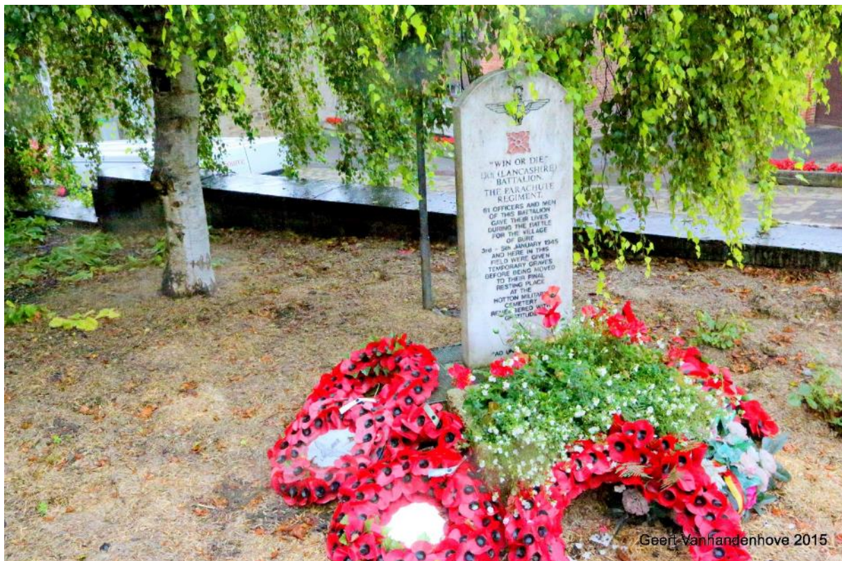
Memorial in front of the church of Bure for the 13th (Lancashire) Battalion