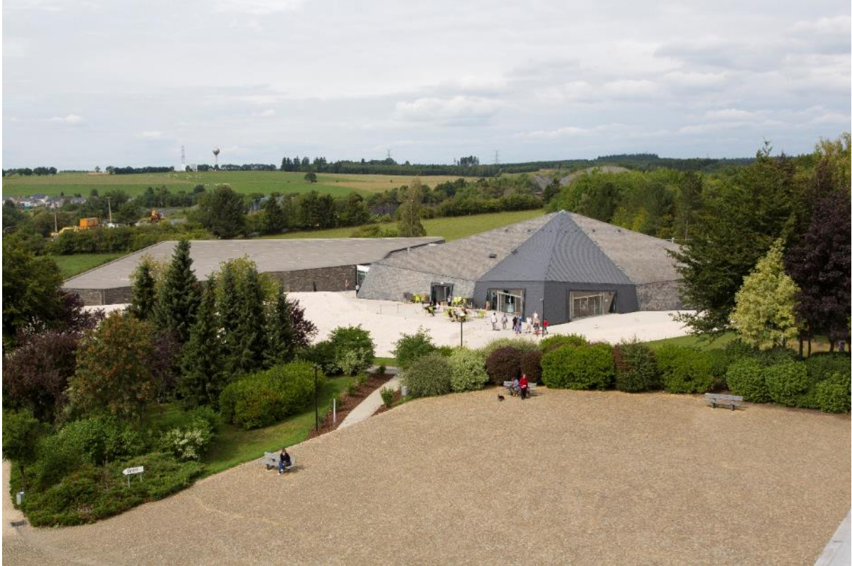
The Bastogne War Museum as seen from the "Mémorial du Mardasson", the American liberators memorial