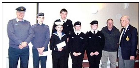
Four Cadet units receive their shares of the Coffee Morning