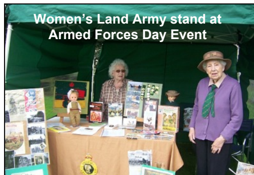
Women's Land Army stand at Armed Forces Day Event

observed F l a g Raising event in Church Square and ended with a varied programme of interesting events and displays in Welland Park on 29 th June.