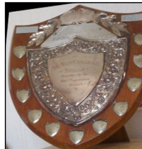
Ron West Shield County Award for 2012-13