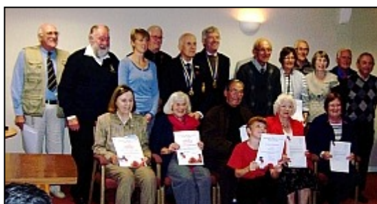
Poppy Appeal Long Service Awards