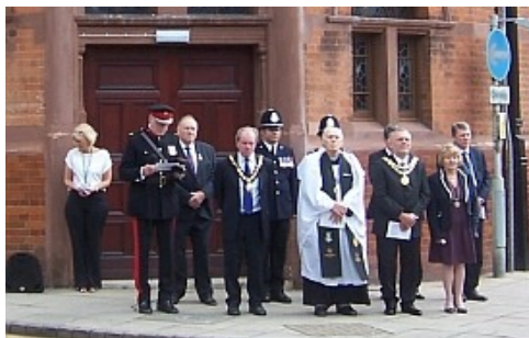
VIPs start Armed forces week at flag raising but Chelsea Pensioners were the stars of Armed Forces Day event