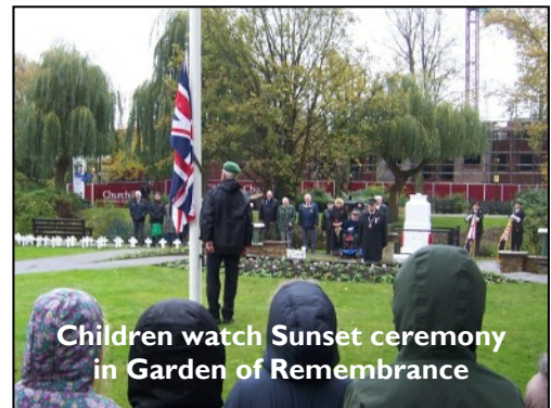
Children watch Sunset ceremony in Garden of Remembrance

The Branch continued to take a prominent part in the local community calendar. It again organised the Remembrance-time Parade, Services, wreath-laying, Remembrance Garden, Sunset Ceremony and Harborough Band Concert. The Poppy Appeal Team had a marquee at the Town Carnival and organised the Appeal launch on The Square with the Northampton Pipe Band and the cadets attracting much attention with their imaginative Poppy kit delivery trolleys. We were again involved with the District Council and others in taking a leading role in the local celebration of Armed Forces Week with branch members as Chairman and Secretary of the organising committee. It started with the nationally