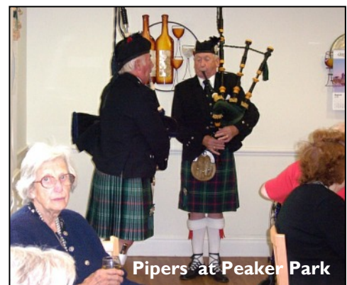
Pipers at Peaker Park

We have maintained close contact with Peaker Park Care Village which encourages Branch members to attend its residents' social events from which we benefit as welcome additions to our social calendar. A shortened August Branch meeting was held there, followed by a jointly organised social event which included music by two pipers one of whom is a branch member. The theme of the event was the WW1 centenary with staff members in contemporary dress.