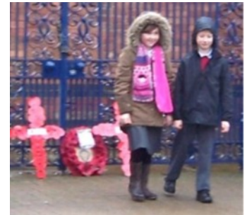
School Children after placing their own crosses on Armistice Day