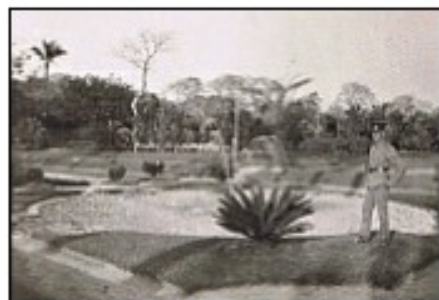
Lake in Nuzha Gardens

That name rang a bell so I wrote back saying that Dad took photos of the gardens (which are on the website)