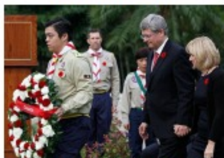
Hong Kong, China - the Canadian prime minister, Stephen Harper, and his wife, Laureen, at Sai Wan war cemetery