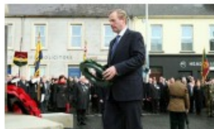
Enda Kenny Republic of Ireland, Prime Minister, prepares to lay a wreath at the cenotaph in Enniskillen in Northern Ireland