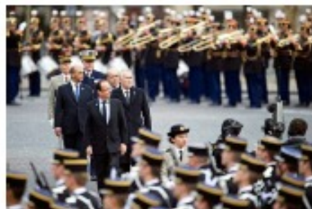
Paris, Place de l'Etoile - President and Prime minister review troops