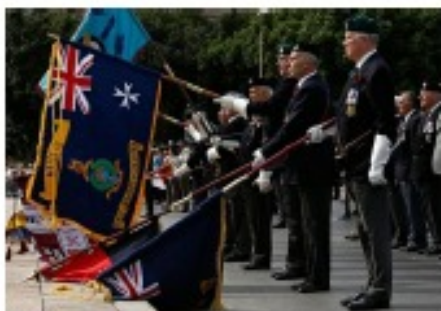
Valletta, Malta- war veterans raise their standards after two minutes' silence at the Cenotaph