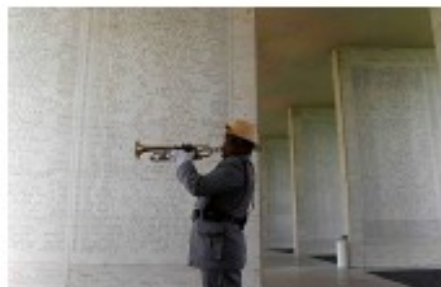
Taguig City, Philippines -A Filipino soldier plays Taps beside the memorial hall, where the names of fallen US soldiers are recorded