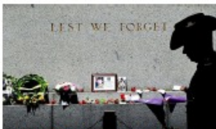
Sydney, Australia- a soldier walks past the Cenotaph at the Remembrance Day service held at Martin Place