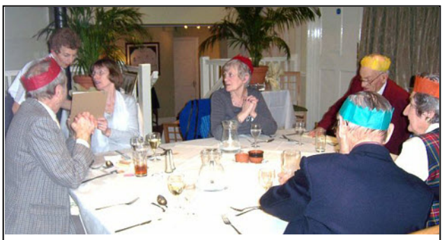
Mainly RAFA members on this table some wearing their Christmas cracker hats.

of members with occasional 'new faces' but overall numbers have been fewer than they used to be. The January belated Christmas Luncheon was again shared with our RAFA and RNA friends as was the Anniversary Dinner in March. As in previous it was held at the Market Harborough Golf Club where we were joined by members of Desborough and Husbands Bosworth branches and the Cadets. There were more 'after meeting' social events than last year: Two Buffets , in November and February; Christmas