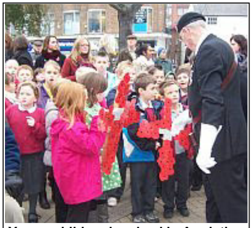
Young children involved in Armistice Day observance

Armistice Day observances followed the now established routine of wreath-laying at the small memorial in Welland Park followed by that at the gates to the Memorial Gardens. There the large