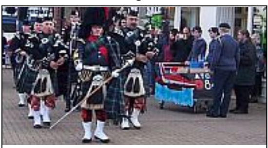
The Pipe Band with some of the Cadets who took Poppies to the shops. (2010 photo)

It is now taken for granted that the Branch will take a prominent part in the local community calendar. The Branch organised the Remembrance Parade and Services, created the Remembrance