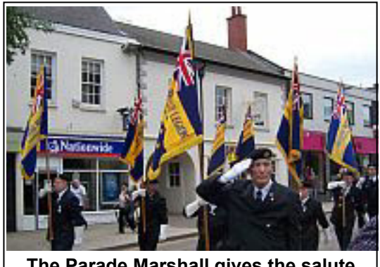
The Parade Marshall gives the salute

have become residents, has been developed to encourage collaboration between Branch and the organisation.