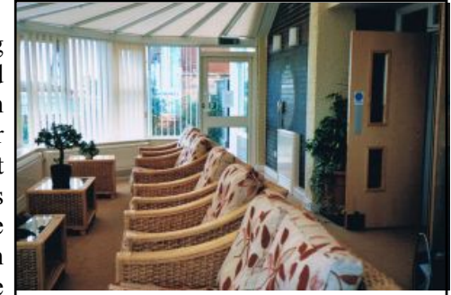
The conservatory at Alterson House

During the past year, the Team has dealt with varying applications and queries. Some have concerned holidays at a Legion Poppy Break Centre which can provide a break for serving and ex-Service people, their partners, dependants and carers. It is means-tested but consideration is always given to a social as well as financial need. Some enquiries have resulted in the completion of a Form A. Where an applicant is not in receipt of a means-tested benefit, this form will enable County Office to decide if there is a financial need.