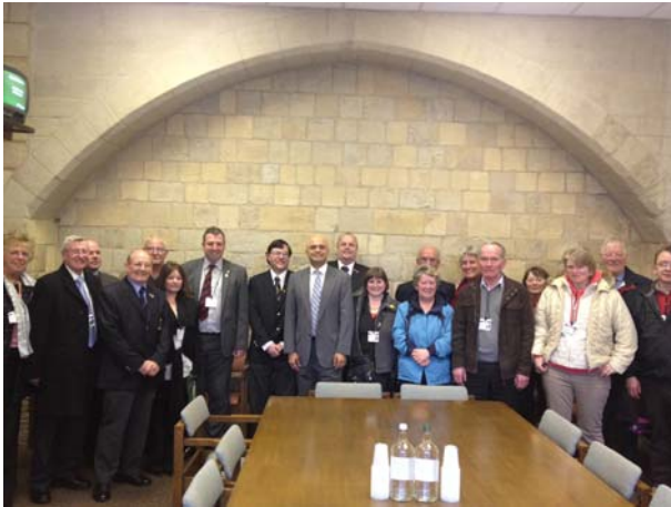
Lickey End branch and their guests with Bromsgrove MP, Sajid Javid.

It is well worth considering a branch trip to Westminster; most MPs are very keen to be involved with Legion branches in their constituencies. The tours are free.