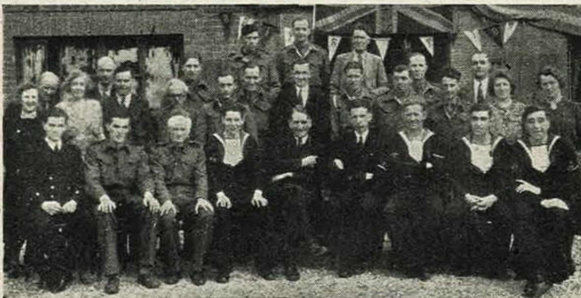
Repatriated prisoners of war—including many Navy boys—and their wives were entertained by Park Gate (Southampton) branch and Women's Section. There were 52 guests to tea. They had strawberries for the first time since the war.

Repatriated prisoners of war – including many Navy boys – and their wives were entertained by Park Gate (Southampton) Branch and Women's Section. There were 52 guests to tea. They had strawberries for the first time since the war.