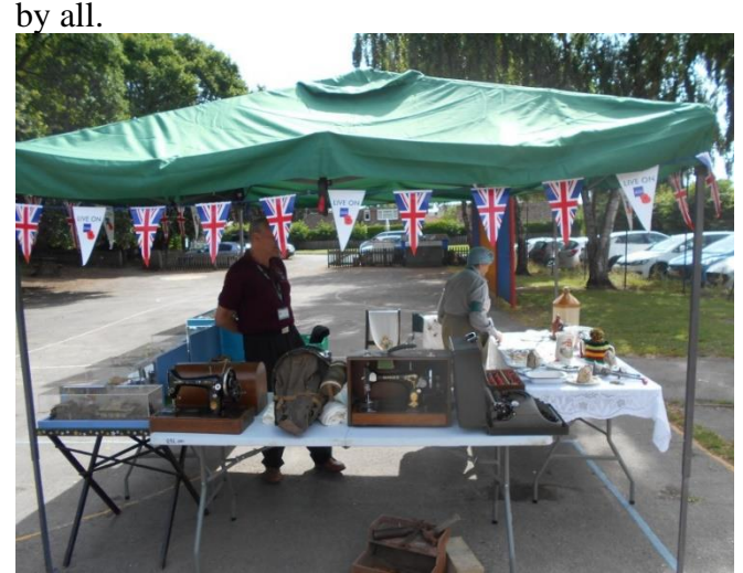
Kingsclere RBL supporting the Kingsclere School WW2 Project

A key theme on our branch plan is to provide support to the wider village community including the Guides, Scouts, Parish Council and school; a number of our branch put on a display for the village school in July as part of their WW2 themed project. A pop up museum of "show and tell" items were put out and a great day was had