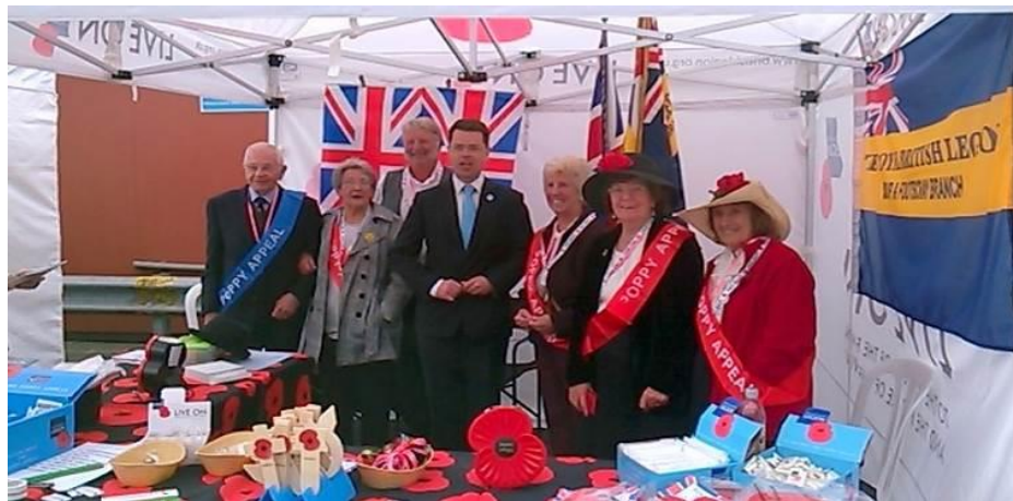
James Brokenshire MP with branch members