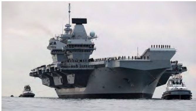
HMS QUEEN ELIZABETH

The launch of Bristol Poppy Appeal will be a little different this year! It will involve images released every day on Social Media depicting various aspects of the local Poppy Appeal, including those who support it, those who volunteer for it and those who benefit from it.