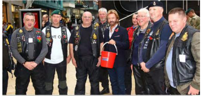
RBL Riders and Celebrities