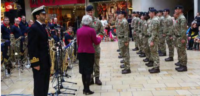
The day when Members of the Armed Forces