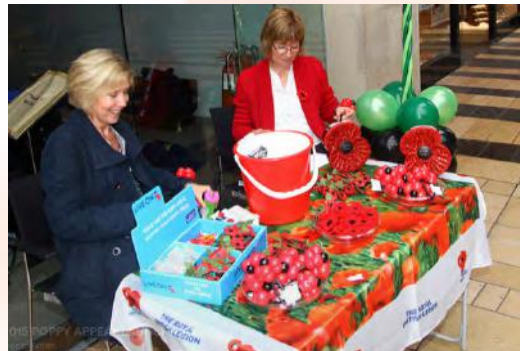
And lots of our wonderful Volunteers