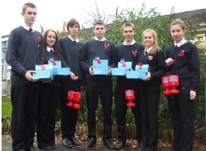
(John Ruskin School raising over £600 in Coniston)

There are more opportunities than we can take to support our service and ex-service community here in Cumbria and the Isle of Man. The telephone lines in our Welfare office 'never stop ringing' for help!