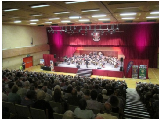
Gala Concert in Kendal raises over £8000!