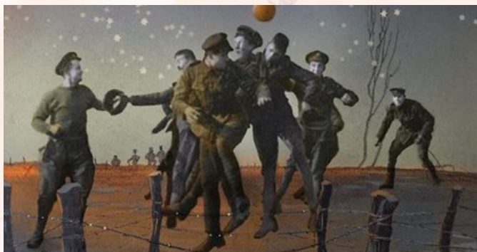
WW1 Centenary Christmas Football Match raised £803.60

Poppy Shop based in the Lanes pictured above right raised £10,416.62 plus £6000 (Total £16,416.62) in Keep the Change and Donations.