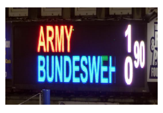
Don't mention the score!