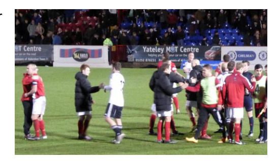
Peace and Goodwill - Christmas 2014

A memorable night reviving memories of a historical incident of huge significance.