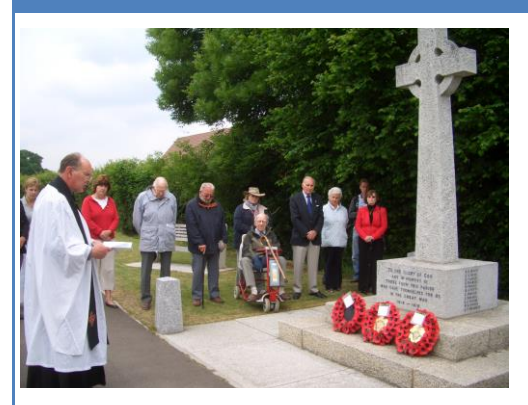
A local Act of Remembrance ... 'no more or less important than the big events staged nationally'

As the nation's Custodian of Remembrance our thoughts in these early days of November are focused on Festivals and Services of Remembrance and wreath laying ceremonies - locally and nationally.