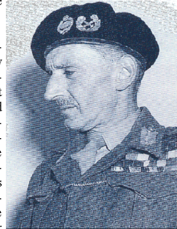
With acknowledgements to the Royal Army Pay Corps Association