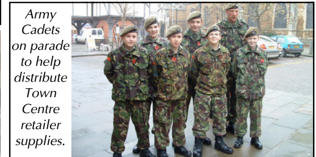
Army Cadets on parade to help distribute Town Centre retailer supplies.