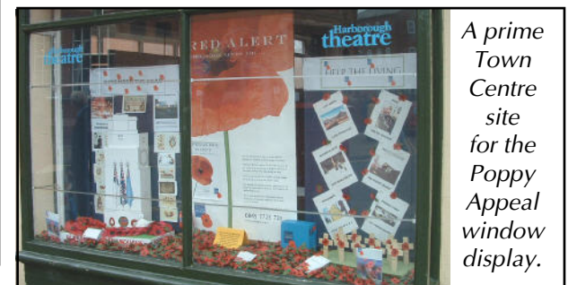
A prime Town Centre site for the Poppy Appeal window display.