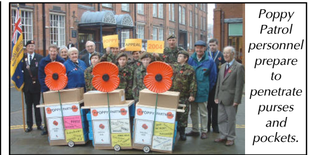
Poppy Patrol personnel prepare to penetrate purses and pockets.