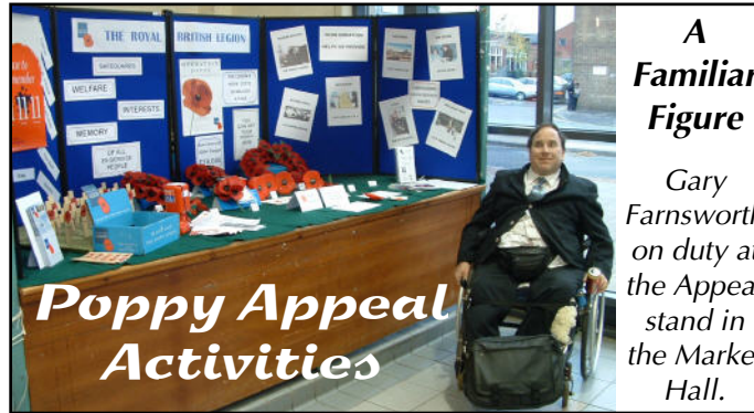
Poppy Appeal Activities

Caseworkers and other helpers providing an essential service in the Community.