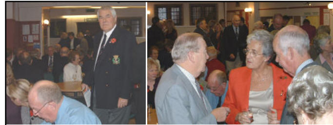
Branch Members and friends enjoying the Poppy Appeal Gala Night in the Harborough Theatre on 8th November.